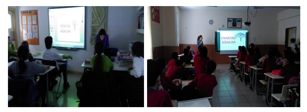
Figure 1. Views from the application.

students had already studied fractals during the semestr, majority of them managed to answer the question. Some of the replies from students are as follows: "it is an arts of decoration, they are geometric shapes, they are intertwined shapes, it is a symmetry, it is a mosque decoration, and lances are fractals...". A presentation prepared with some examples of fractals was shown to the students and some examples of fractals in the nature were presented to the students. Students were given a worksheet that had simple fractals and were helped to remember fractals. Looking at the examples of fractals, students were seen to have an idea that fractals actually have formal structures. The presentation lasts approximately 25 minutes.